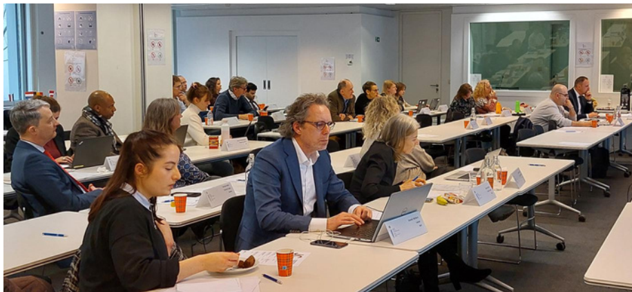
Final plenary session.

Lastly, regarding the utilization of digital means to promote the EU tool, practitioners promptly advocated for the usefulness of newsletters aimed at judges, magistrates, prosecutors, lawyers, probation officers, and key judicial experts. At a broader level, an interesting idea concerns the use of AI tools to update the intranet of judicial offices, but also to create a platform or forum where experts in the field can ask and answer to questions, directly contact foreign colleague and, share best practices.